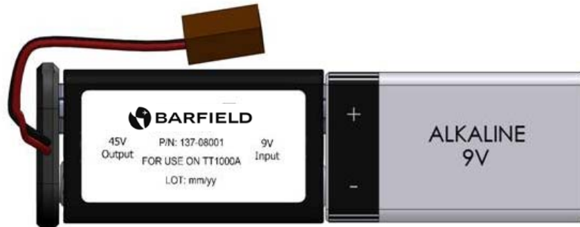
VOLTAGE CONVERSION Figure 2